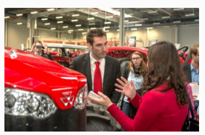
Visit to the factory of AGCO (Changzhou) Agricultural Machinery Co., Ltd.