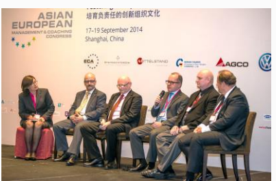
Plenary meeting with representatives of the European medium-sized enterprises in China